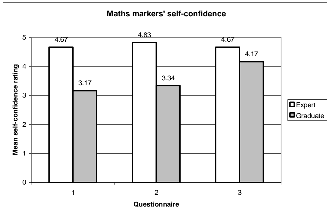
Figure 1: Graph showing the mean self-confidence ratings of expert and graduate maths markers

Figure 2 shows the mean self-confidence ratings of the physics markers. The ratings of experts and graduates were compared. In contrast with maths, no significant differences were identified between the two marker groups on any of the three questionnaires.