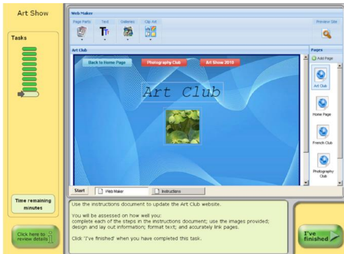
Figure 1: Part of the Art Show 'large task'

Figure 1 shows a screenshot from the Art Show 'large task'. Note that the test interface (including the yellow borders) received a minor update for the 2014 cycle; the task interface ("Web Maker") was left untouched so as not to interfere with item functioning.