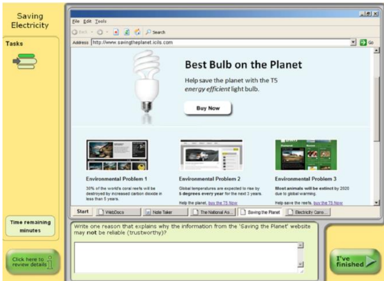
Figure 3: An item from Saving Electricity