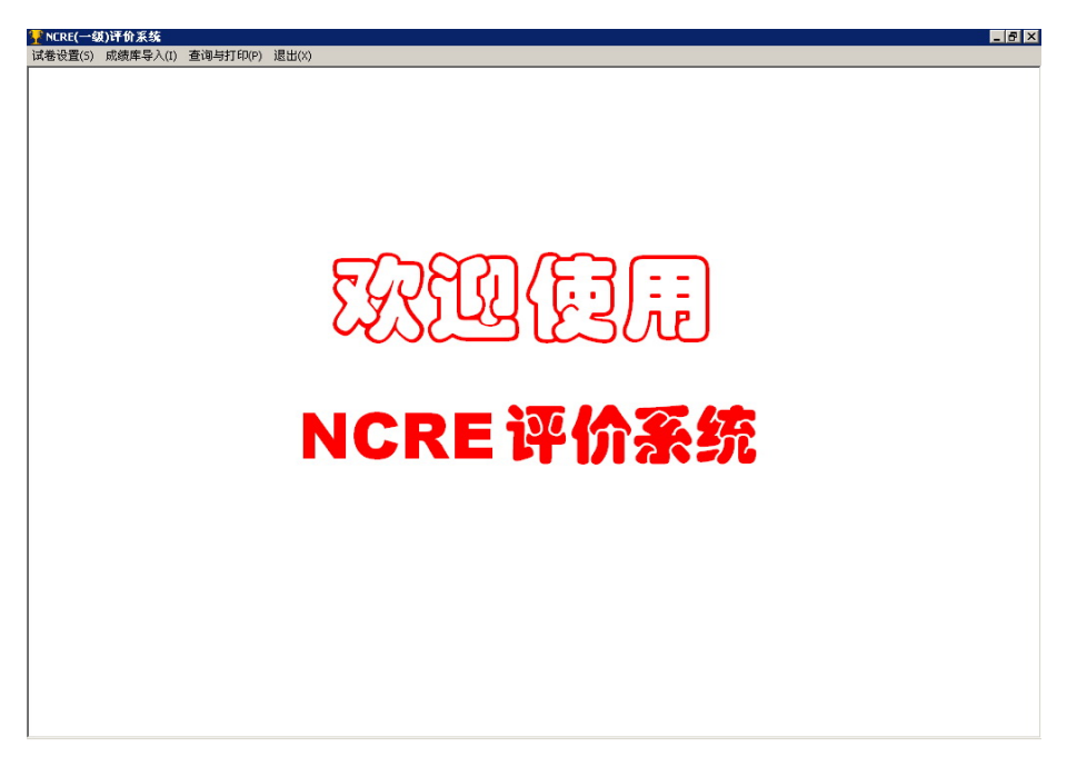
Figure 3 Figure Interface of assessment report software

Data export module is used to export the database according to user needs in the field, or to export the database in different formats.